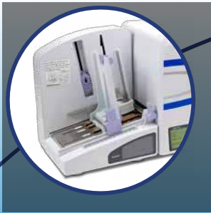
Stack Operation (Stacker Optional)