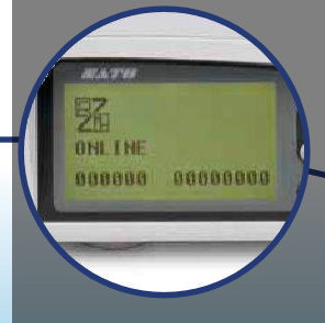
Large, Easy to Read LCD Display